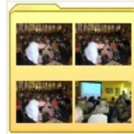
2006-02-24 GBH Airport