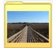
Low Country Landscapes