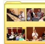
2006-03-18 Sun City